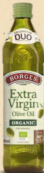
Extra Virgin Olive Oil