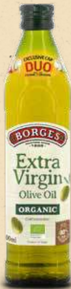
Extra Virgin Olive Oil